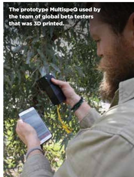
The prototype MultispeQ used by the team of global beta testers that was 3D printed.